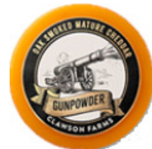
Oak Smoked Cheddar

Cheese Advent Calendar 480g XM105 £11.95ea (A great gift including 24 cheesy treats leading up to the big day)