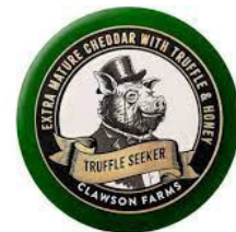
Truffle & Honey