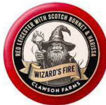
Red Leicester with Scotch Bonnet & Harissa