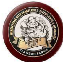
Wensleydale with Cranberry, Elderflower & Marmalade