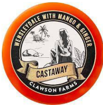
Mango & Ginger