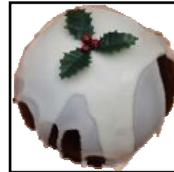
Waxed Christmas Pudding One of the Biggest selling products year after year!